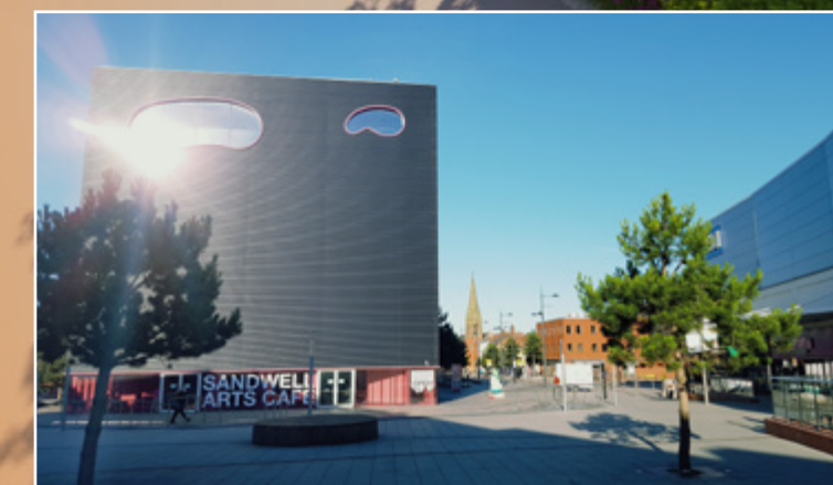
Walsall Town Centre Regeneration (Rendering)