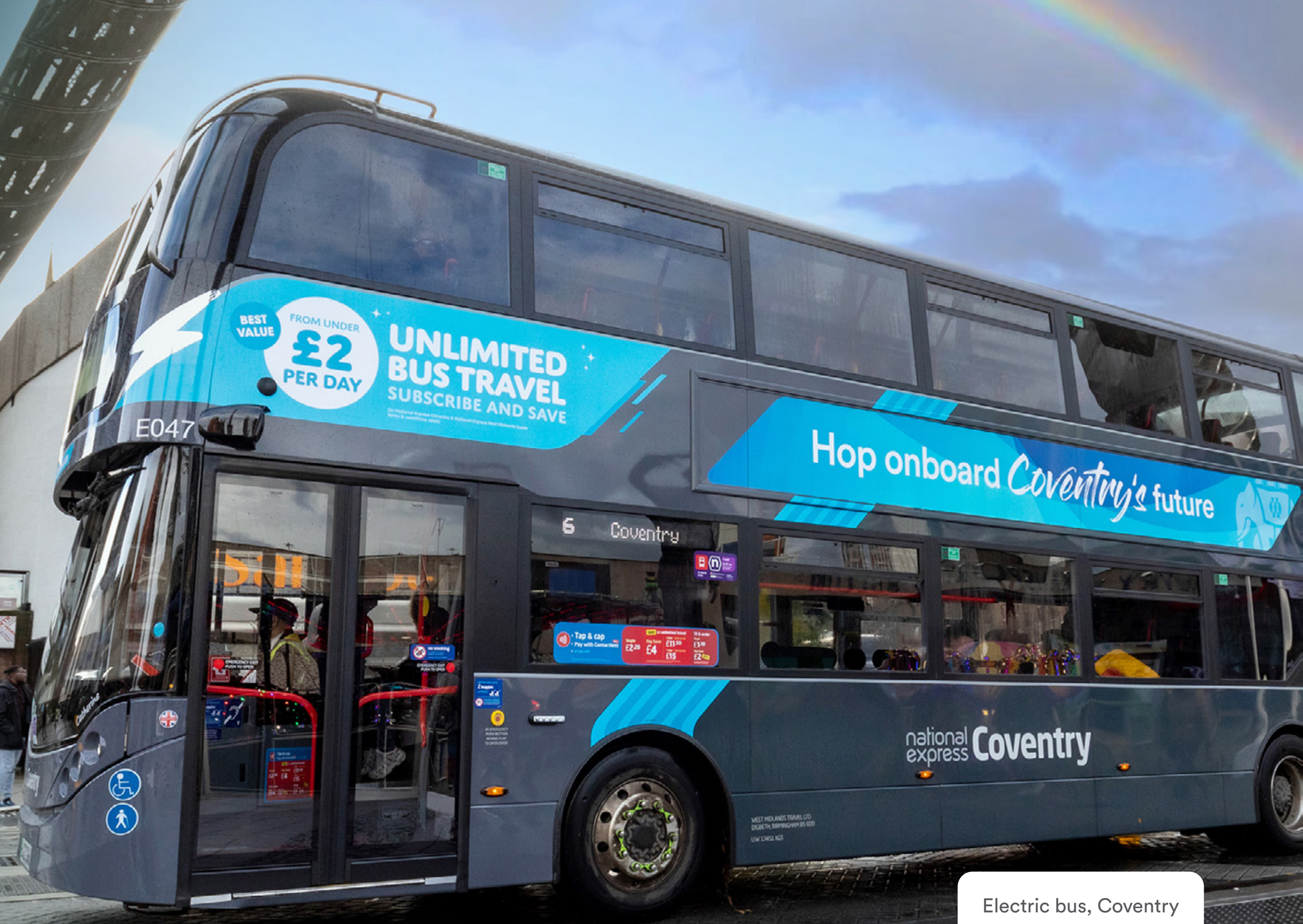
Electric bus, Coventry

We are pioneering world-class transport services and technology in the West Midlands, and Birmingham (NEC) will be hosting the World Intelligent Transport Systems (ITS) Congress in 2027.