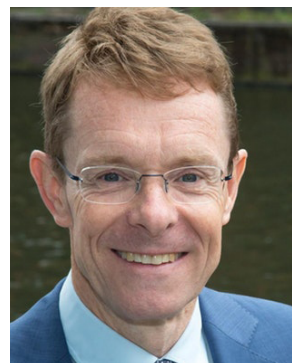
Andy Street, Mayor of the West Midlands

Working together, we have the opportunity to prevent and design out homelessness across the West Midlands.