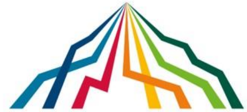
G7 GERMANY 2015 | G7 Alliance for Resource Efficiency